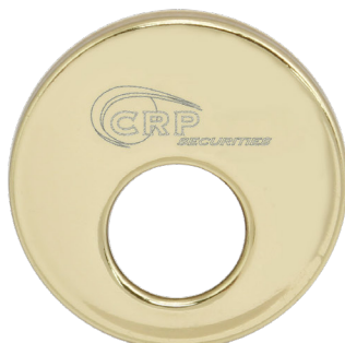
US3/605-632 POLISHED BRASS