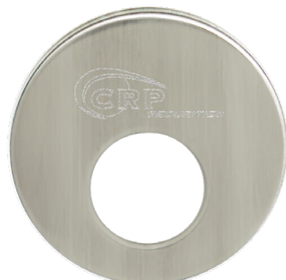
US15/619-646 SATIN NICKEL