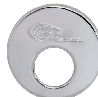
US26/625-651 POLISHED CHROME