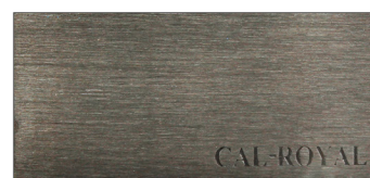
US15A/620-647 SATIN NICKEL OXIDIZED