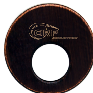
US11P VENETIAN BRONZE