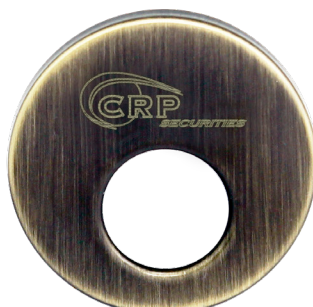
US5/609-638 ANTIQUÉ BRASS