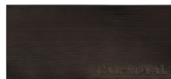
US17A/621-648 SATIN BLACK NICKEL