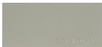
USP/600 PRIME COAT