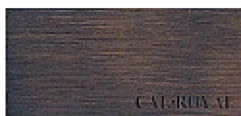
US10A/614-641 ANTIQUÉ BRONZE LACQUERED