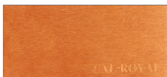
US10/612-639 SATIN BRONZE