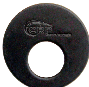
US10B/613-640 ANTIQUÉ BRONZE OILED