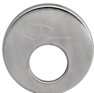
US32D/630 SATIN STAINLESS STEEL