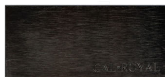
US14B BRIGHT BLACK NICKEL