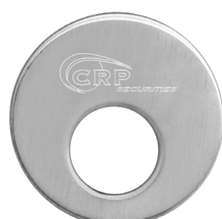
US26D/626-652 SATIN CHROME