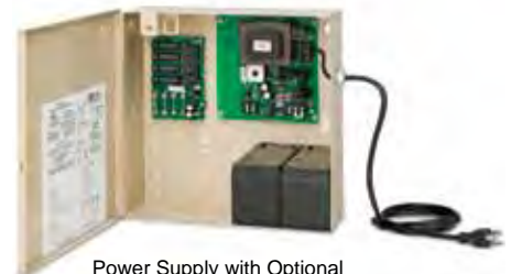
Power Supply with Optional CR4 and PC 6 Foot Power Cord