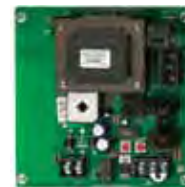
602RFL 1 Amp Power Supply Less Box

Door Control Modules SDC relay modules may be incorporated in the power supplies to meet virtually any application requirement, for single or multiple door control.