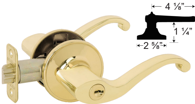
LEPRE00 (HANDED) SPECIFY