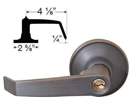
BRISTOL "BRI" SERIES (NON-HANDED)