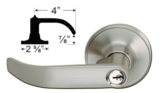
SOPHIA "SOP" SERIES (NON-HANDED)