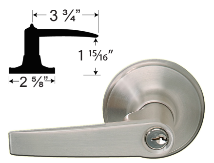
LENOX "LEN" SERIES (NON-HANDED)