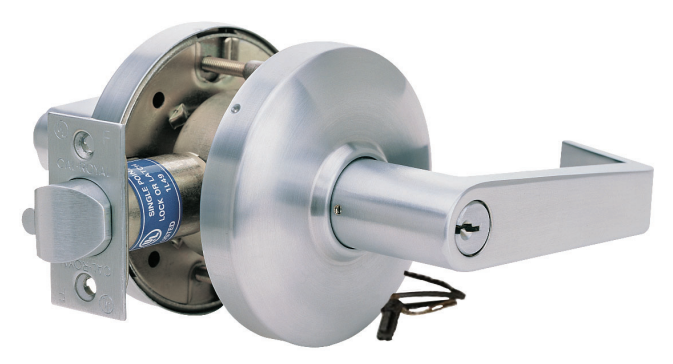
Available on all Genesys Series lever designs

(Universal Dual Voltage 12 to 24 VDC, Field Convertible EL to EU & Vice Versa)