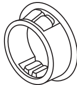
STRIKE HOLE PLUG