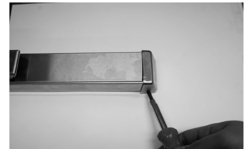
10. Fasten the (2) screws to the End Cap.