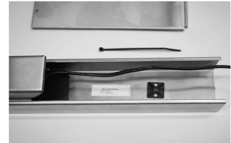
6. Flip the shim cover and attach the Label Sticker and Cable tie mount using its pre-installed double sided adhesive.