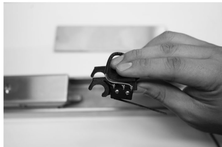
3. Prepare the RX-switch, hold it in this position and remember the phrase "slide and click".