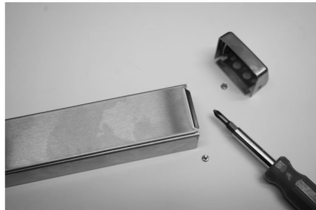
1. Remove Exit Device End Cap.