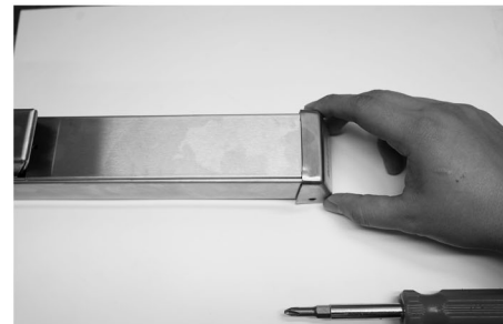
9. Re-install the End Cap of the Exit Device.