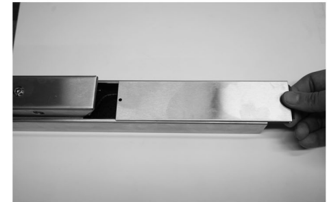
8. Re-insert the shim by sliding it back in place to the Exit Device body. Then check the function of the RX-switch.