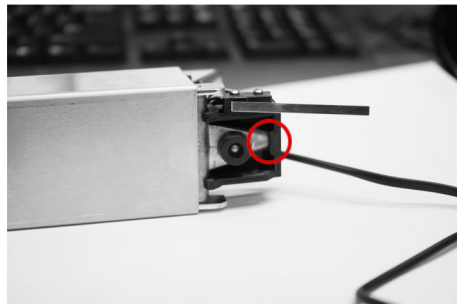
4. Make sure the bracket tab clips to the base of the push bar assembly.