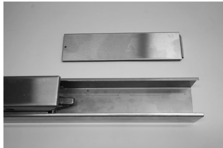
2. Slide and remove the shim from the body.